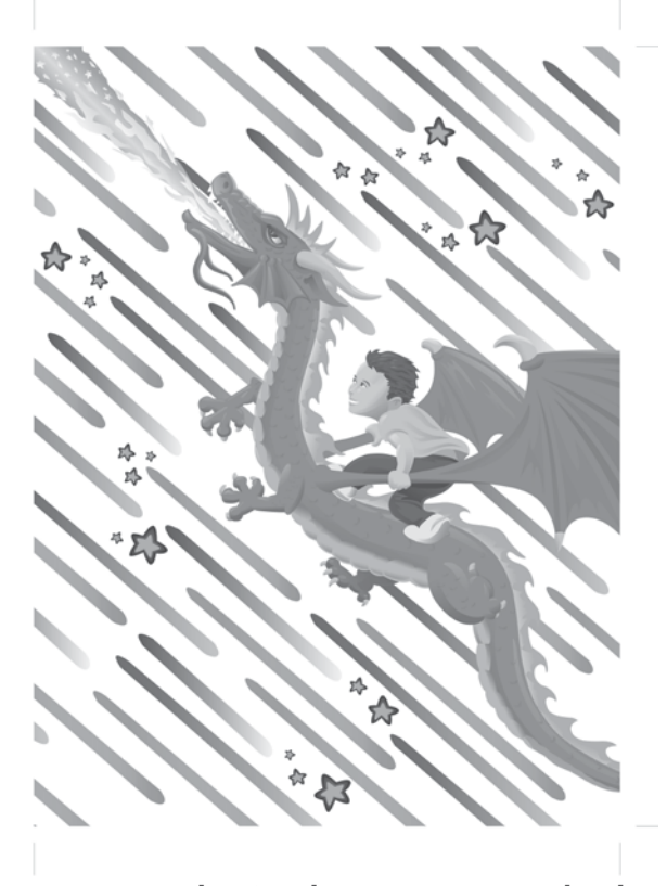
The Word Up Project: Level Indigo

I've accomplished everything; yes, I've done it, You play the game, I run it. Breakfast on Mount Everest, on the summit. The tip-top of the mountain—son, yes, I'm on it. I rap so loud cause an avalanche, Snow falling down to the ground from the sound of it. I don't ride on sports cars or your nice bikes, I ride a golden dragon; yeah, that's right. He's my guardian, and he protects me, Whenever enemies come to try and test me. He flies me to Mexico just to jet-ski, He breathes fire and it smells like Pepsi. He resembles a plane and looks like a jet, He gets me all the things I could not get. He flies me overseas, over pastures, The fields where the sheep and cows eat their grass or Hay or whatever they eat; I can't say, I'm flying high above and can't see that way. When you fly above the clouds, every day is Sunday, I think he's going to fly me to the moon someday.